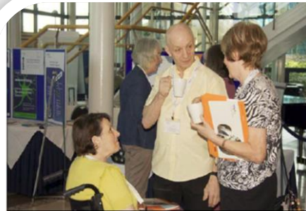
Delegates at the Manchester Spring Conference