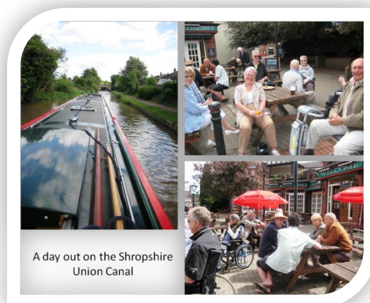
A day out on the Shropshire Union Canal

We set off at approximately 10.45am and tea and biscuits were served. As the narrowboats leisurely made their way to Chester, the weather improved. We reached Cow Lane Bridge at about 1.00pm and everyone disembarked and went to the "Frog and Nightingale" (see pictures). On the way back a picnic lunch was served.